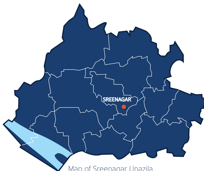
Map of Sreenagar Upazila