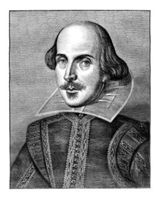
Shakespeare as an adult