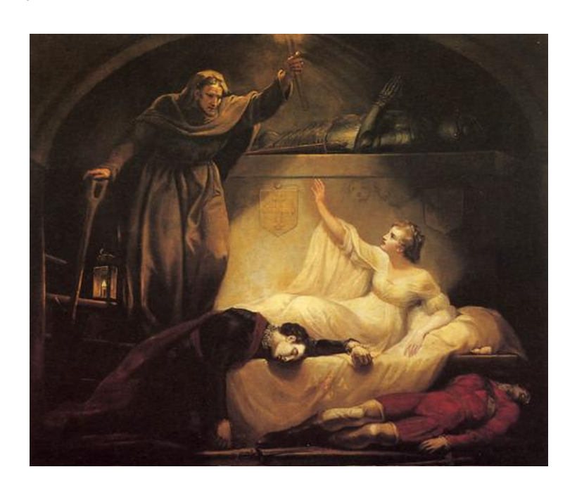
Romeo and Juliet