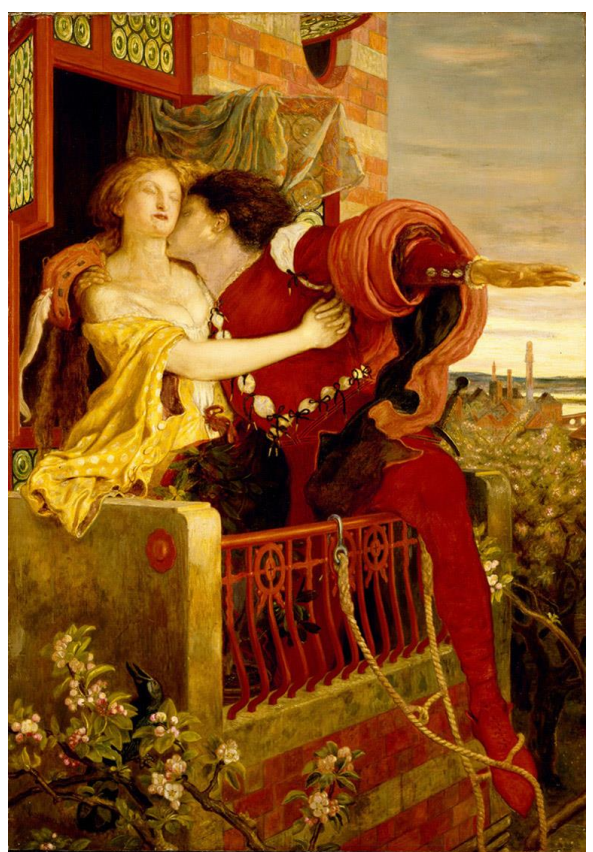
Romeo climbs on to Juliet's balcony

Romeo and Juliet is probably the most famous romantic story in the world. There have been thousands of productions of the play and many different versions of the film. In the story, the two families of Capulet and Montague are at war with each other in the city of Verona in Italy. A Montague boy called Romeo and a Capulet girl called Juliet meet and fall in love — even though their families hate each other. The story is a tragedy and although Romeo and Juliet get married they do not live happily, after a bloody and complex story, they each take their own lives.