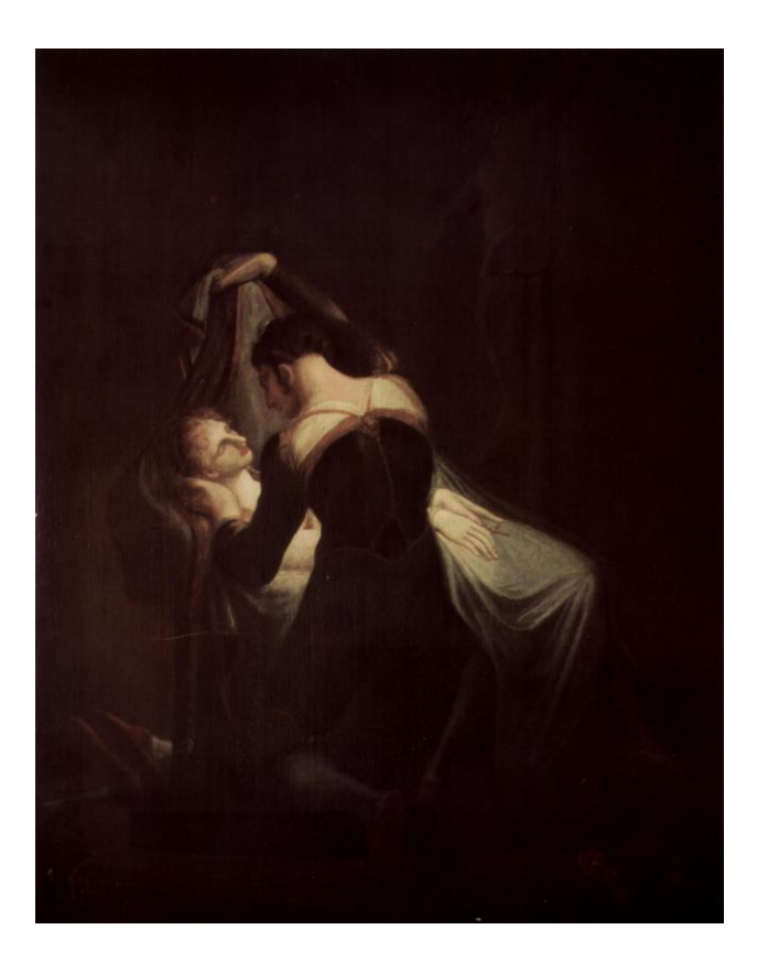
Romeo believes Juliet to be dead

Painting by Edwin Ausin Abbey (1852-1911)