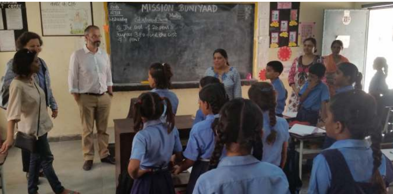
Field visit to school in Delhi

We also administered two semantic fluency tasks which asked children to name as many entities belonging to each of the following two semantic categories as they could within one minute: