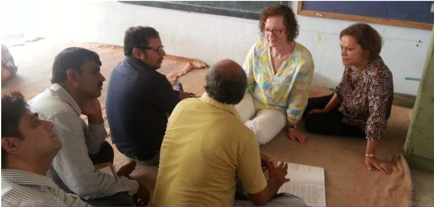
Field visit to a school near Delhi