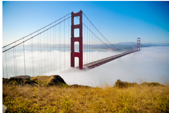
Fog on the Golden Gate Bridge