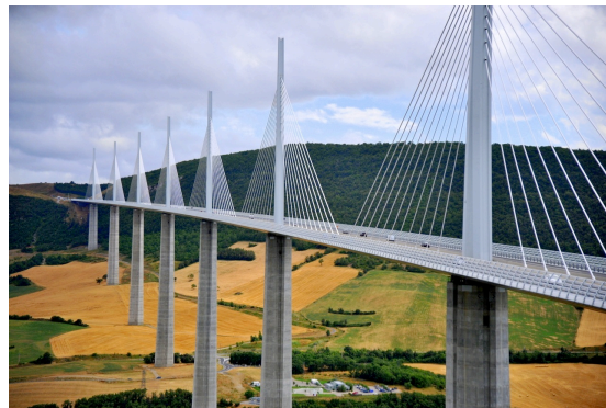
Millau Bridge

All images used are licensed under Creative Commons licenses: