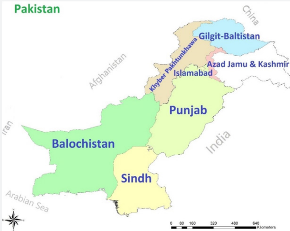
Figure 1: Map of Pakistan

self-governing Gilgit Baltistan region (formerly called Northern Areas) and the self-governing state of Azad Jammu and Kashmir (AJK) (Figure 1).