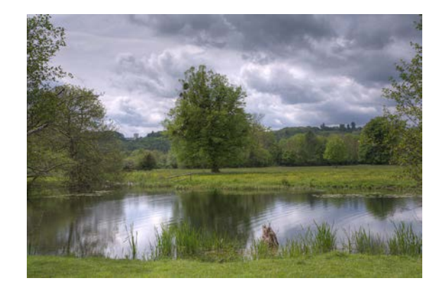
The River Thames at Runnymede

Do you think it has changed much in the past 800 years? Share your ideas with the class.