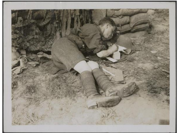
A soldier writing in Mesen, Belgium, 1917

I've got to clean the trench this morning.