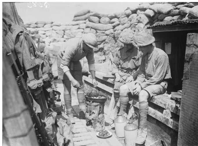
Above – Australian Imperial Force cooking in their trench on the western front.