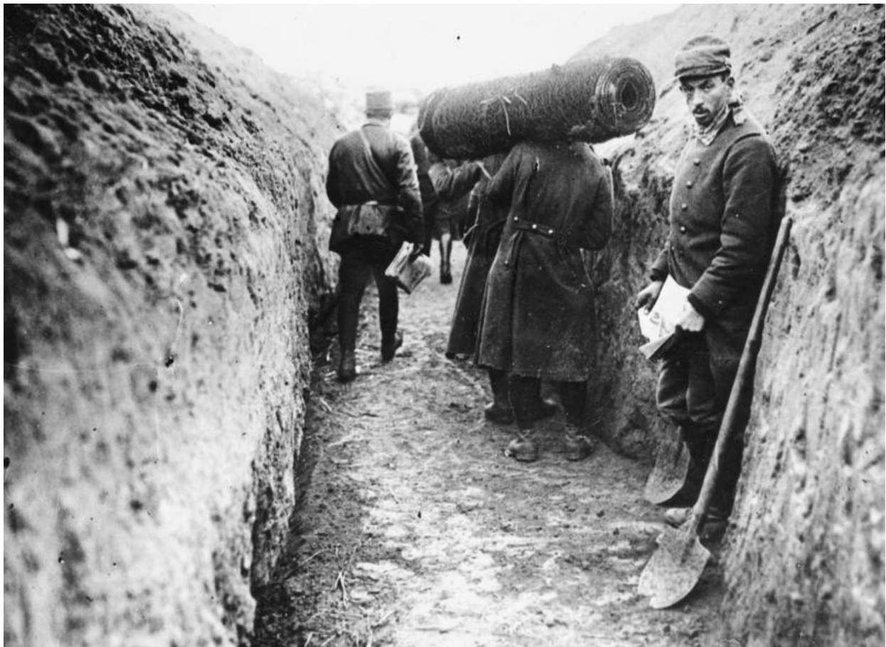
French soldiers preparing a trench, 1914.