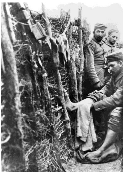
Above – A German soldier in Belgium cleaning his feet.