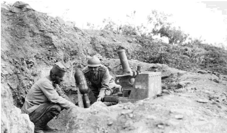
Below – Trench mortars on the Balkan front.