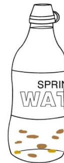
Drink dirty water