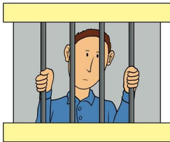
Go to prison