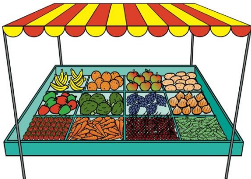
Eat healthy food